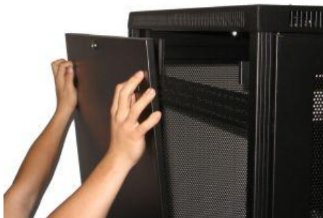
Removable side panel