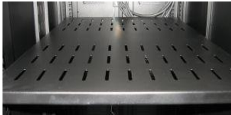
Equipment Shelf (vented)