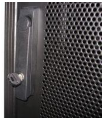
Lockable Perforated Door