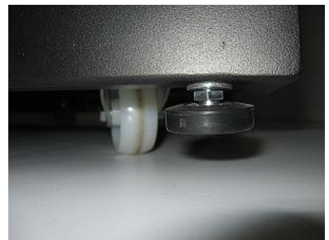
Castor Wheels and Leveling Feet