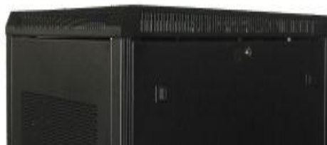
Full slotted Top Frame