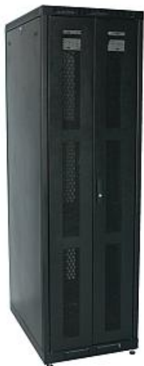
By-Folded Rear Door