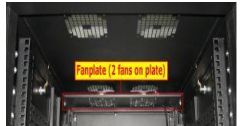
Fanplate (2 fans on plate)