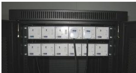
6 Way Horizontal Power Strip x 2 unit