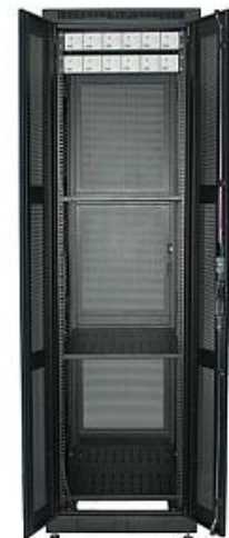
By-Folded Rear Door (both door open)