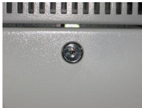
Cam Lock on Side Panels