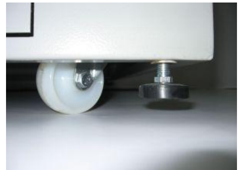
Castor Wheels and Leveling Feet