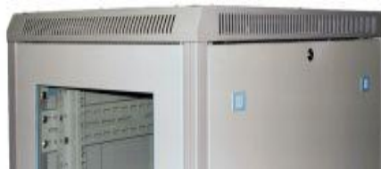
Full slotted Top Frame