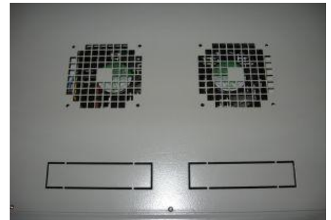
Top Cable Entry Access