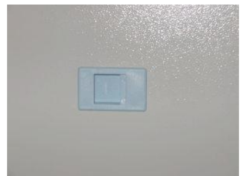
Quick-Release side latch on Side Panels