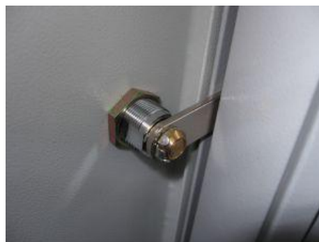
Abloy cam lock (Internal View)