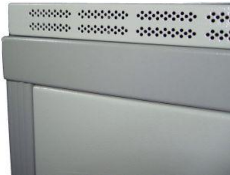
Ventilation holes on Top Cover