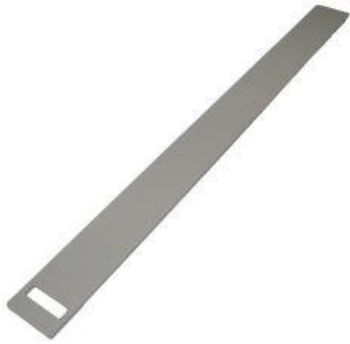
Horizontal security cross bar