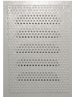
Louvered Front Door (Internal View)