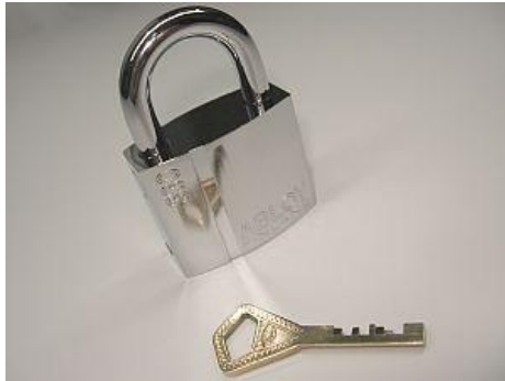
Abloy Padlock with Key