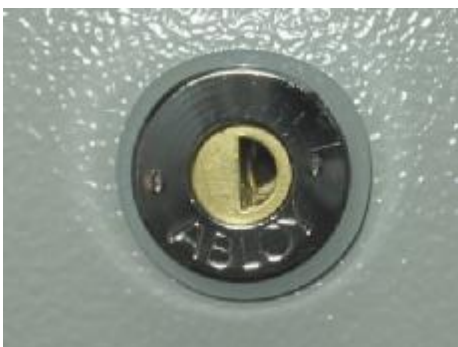
Abloy cam lock (External View)