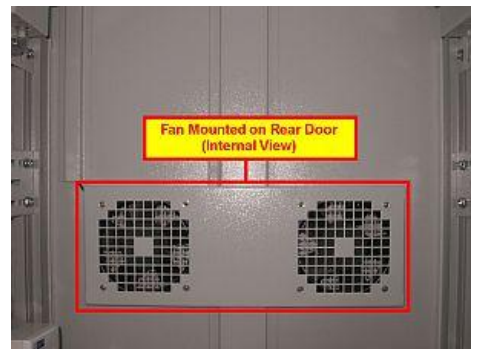
Fan Mounted Louver Rear Door (Internal View)