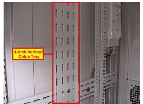
4-inch Vertical Cable Tray