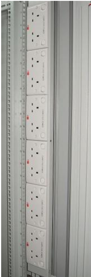
12 Way Power Strip