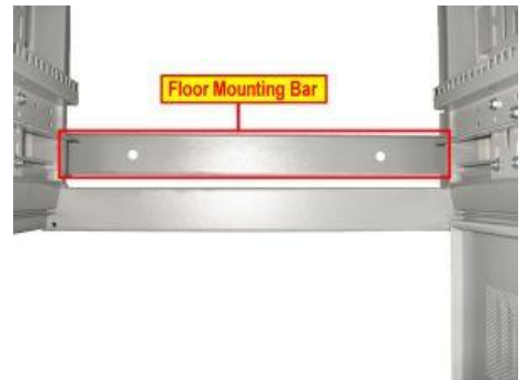
Floor mounting bar