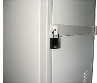
Security Bar & Padlock on Door