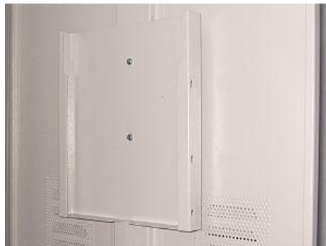
A4 Document Holder