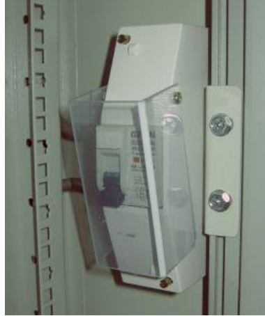
Circuit breaker (40Amp)