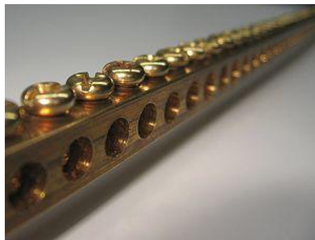
Copper Earth Bar (1000mm)