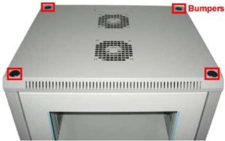
Protective Bumpers (Top)