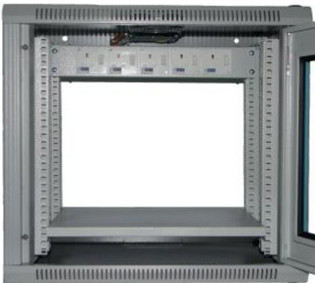
Internal Front View