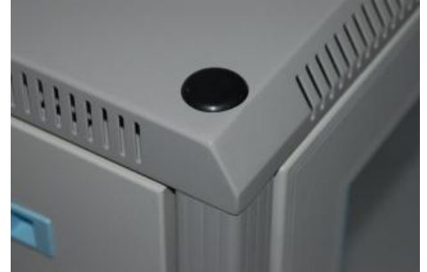
Protective Bumpers (Close-up)