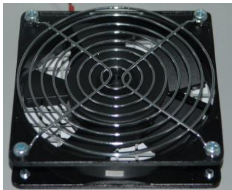
Full Slotted Frame (Top)