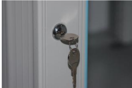
Cam Lock (on Front Glass Door)