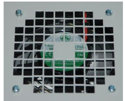
Full Slotted Frame (Bottom)