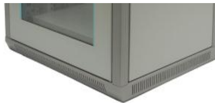
Full Slotted Frame (Bottom)