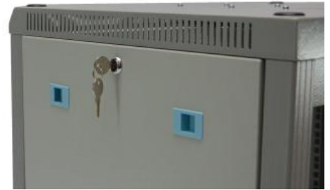
Cam Lock (on Side Panels)