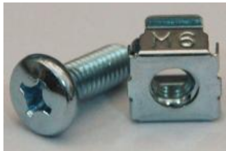
Cagenuts & Screws