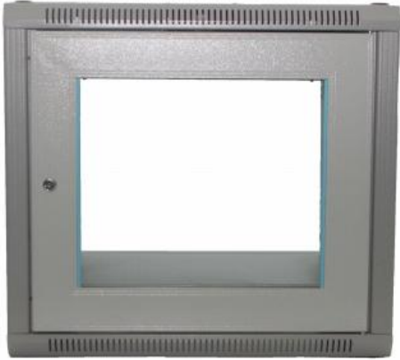
Lockable Front Glass Door