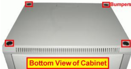
Bottom View of Cabinet Protective Bumpers (Bottom)