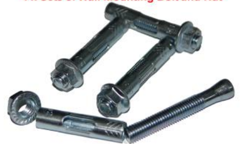
Wall Mounting Bolt and Nuts