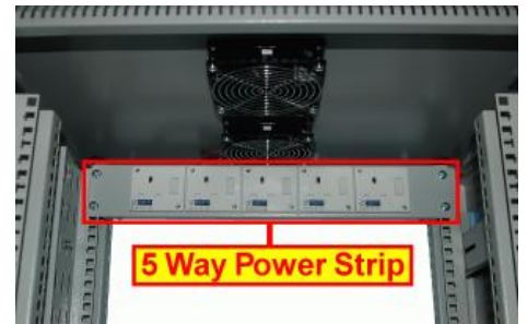
5 Way Power Strip