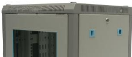
Full Slotted Frame (Top)