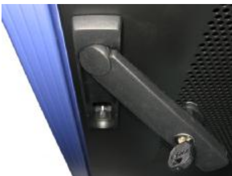
Lockable Perforated Door