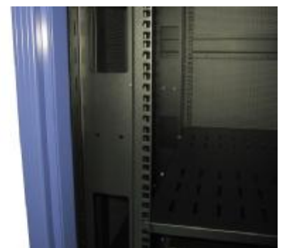
Close up of Cable Management (Rear)