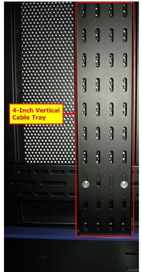
4-inch Vertical Cable Trays