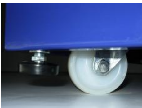
Castor Wheels and Leveling Feet