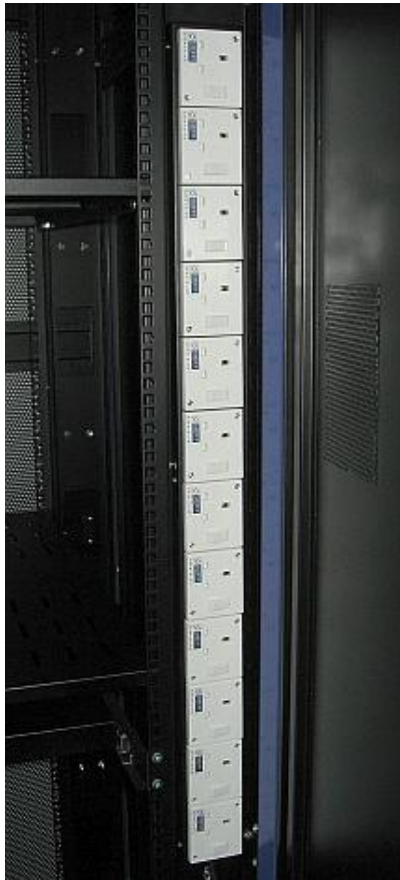
12 Way Power Strip