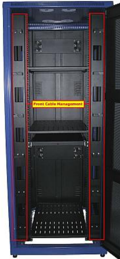
Cable Management (Front)