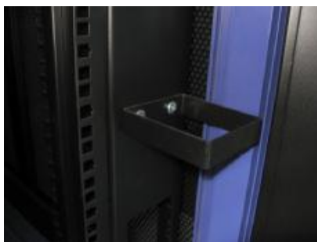
Close up of Cable Management (Front)