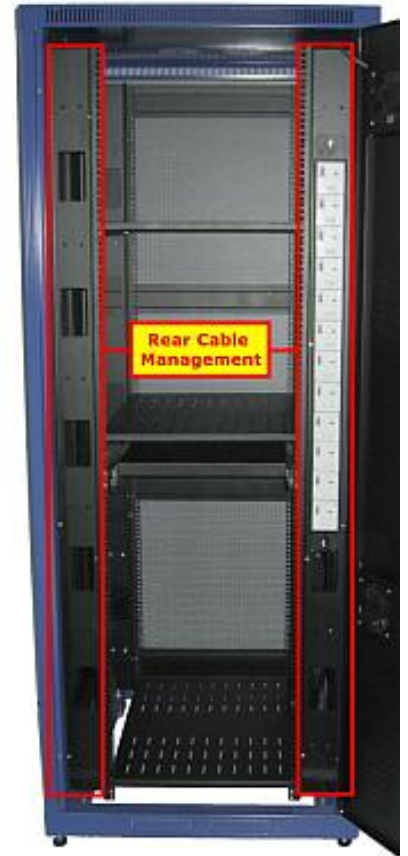
Cable Management (Rear)